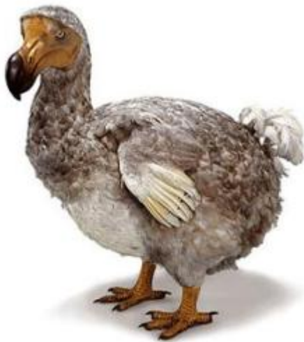
Going the way of the Dodo bird?