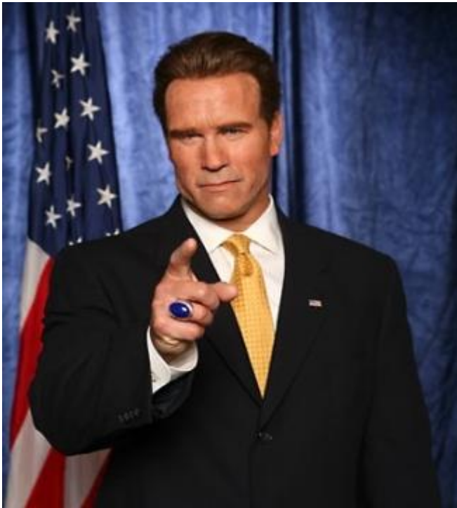
"I'll Be Back"